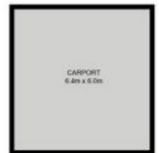
CARPORT 6.4m x 6.0m

Whilst every attempt has been made to ensure the accuracy of the floor plan contained here, measurements of the doors, windows, rooms and any other items are approximate and no responsibility is taken for error, omission or mis-statement. This plan is for illustrative purposes only and should only be used as such by any prospective purchaser. The services systems and appliances shown have not been tested and no guarantee as to their operability or efficiency can be given.