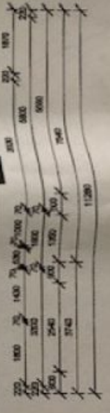
Elevation 1 004a